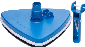
Vacuum Hose, Manual Vacuum