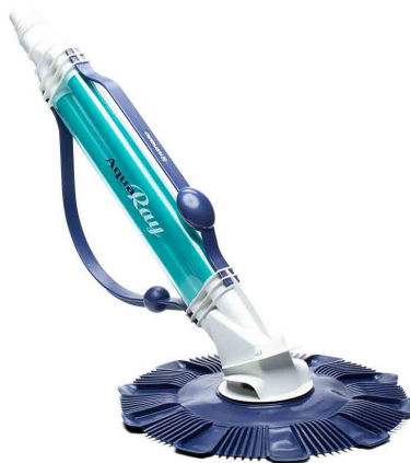
Aqua Ray Automatic Pool Cleaner