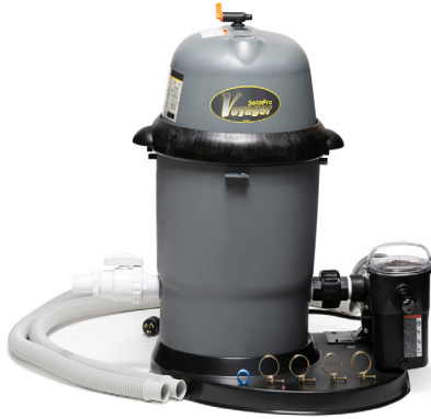
1.5 HP 110 SwimPro Filter w/ T.L