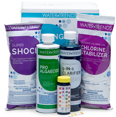
Chemicals and Test Strips